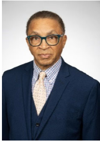
Glenn York Mayor