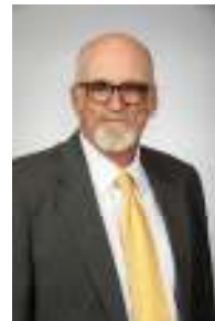
Curtis Strickland Commissioner