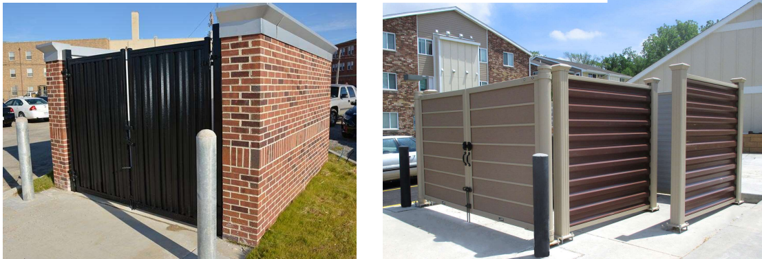
FIGURE 5.3.1.H: COMMERCIAL DUMPSTER ENCLOSURE DESIGN