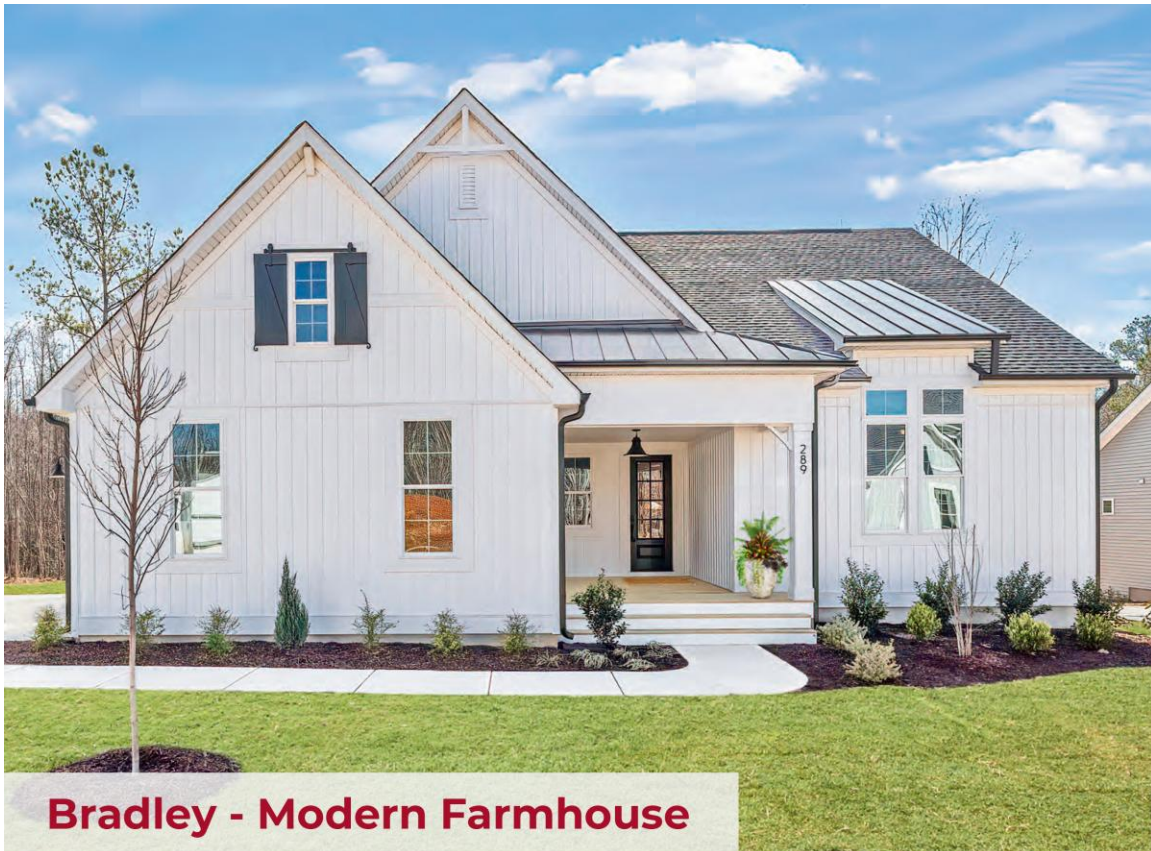
Bradley - Modern Farmhouse

Single Family Detached Unit, Example 1 (Front-Loaded)