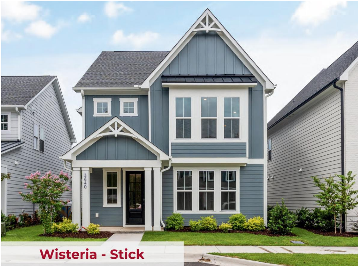
Wisteria - Stick