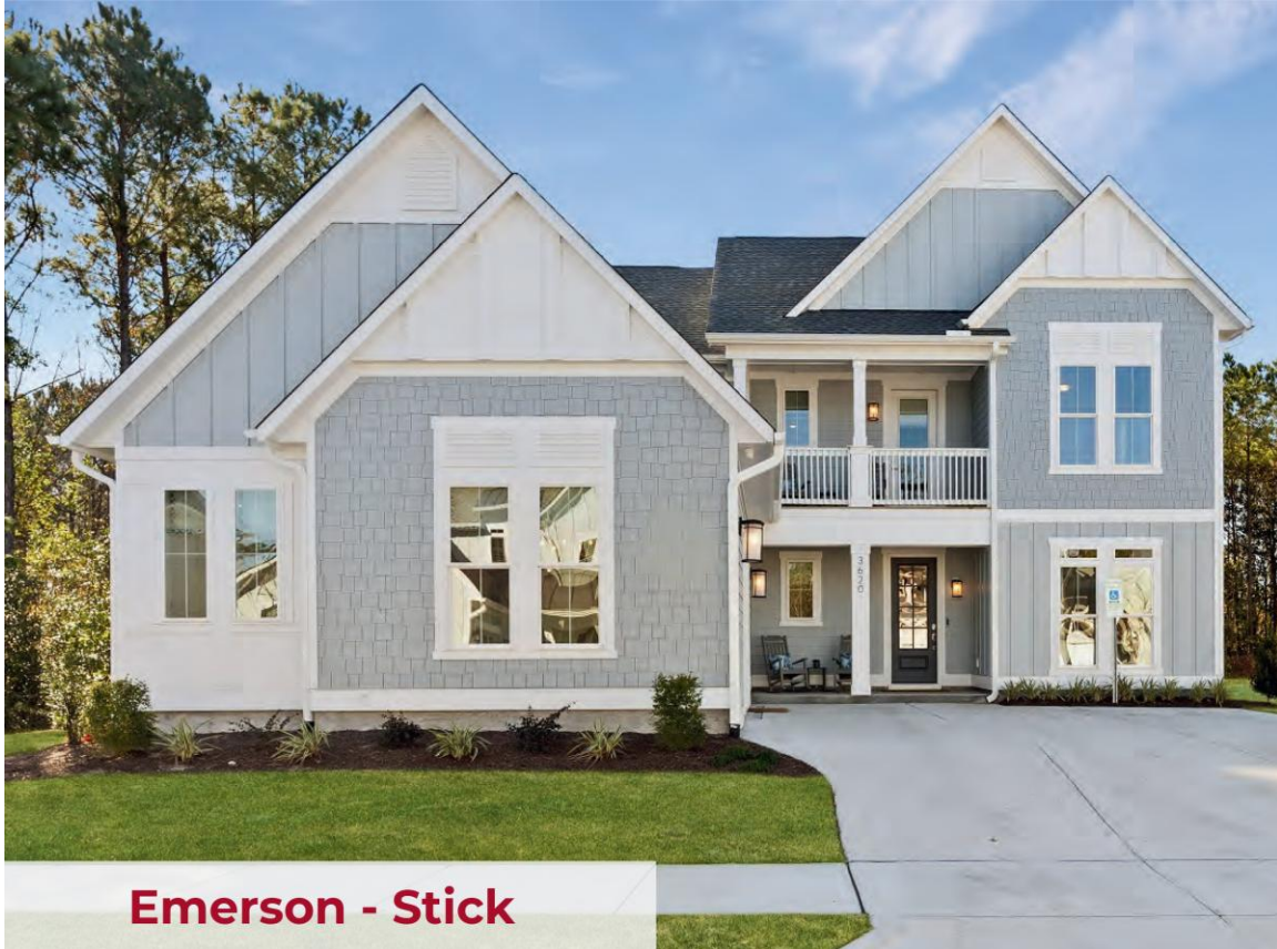
Emerson - Stick