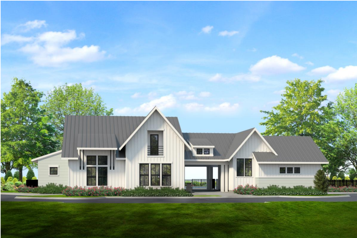
Site Amenity (Front View)